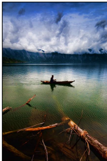
The Boatman